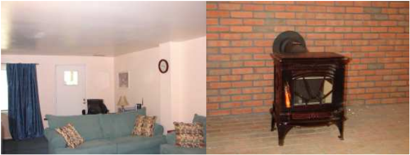
Lower Level Family Room with Walk-out and Full Brick Wall Behind New Woodstove !