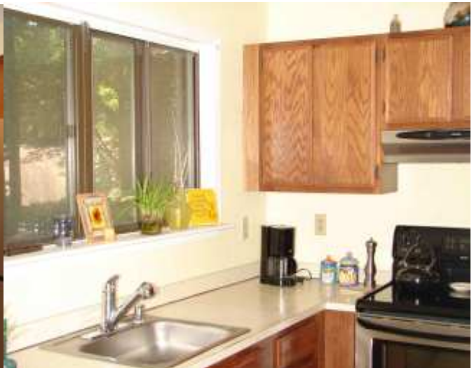
Attractive Kitchen with Stainless Steel Appliances!