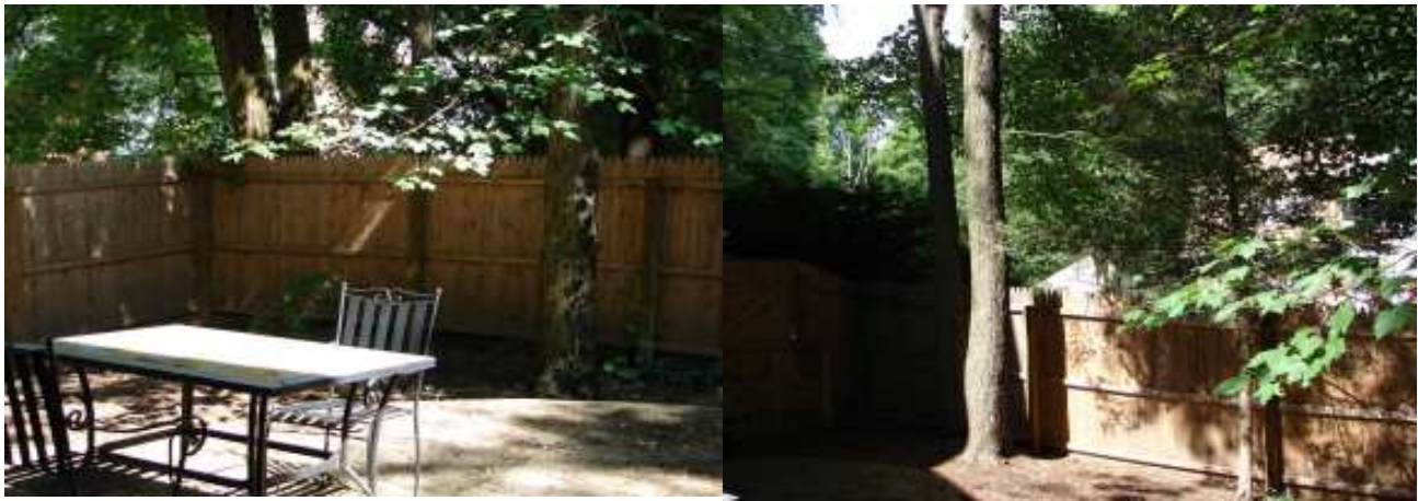
Private Back Yard is Fenced in with Gate!