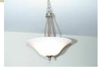
Updated Light Fixtures Everywhere!