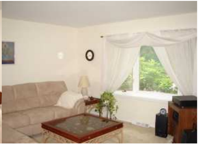
Big Living Room/Dining Room Combination!