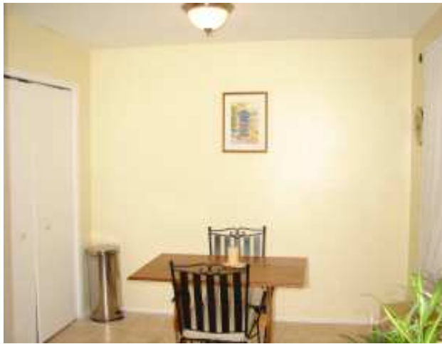
Dining Nook in Kitchen