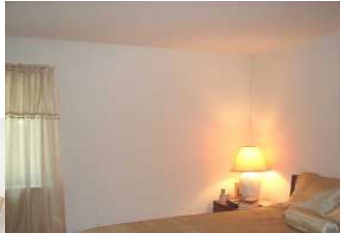
Main Bedroom with Double Closet