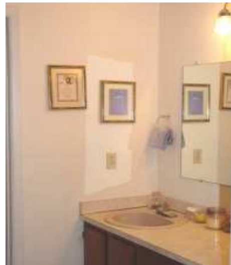
Dressing Area with Vanity Sink Connects Main Bedroom and Hall Bath