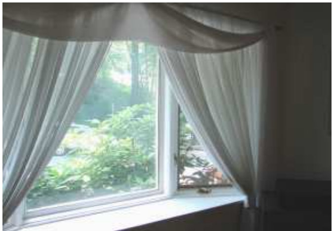
Pella Bay Window with Roll-Up Screens!